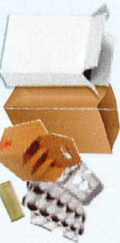
Boxboard (Dry-food boxes, paper bags, egg cartons, rolls)