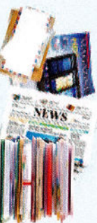
Junk Mail, Periodicals & Office Paper (Catalogs, envelopes, soft cover books)