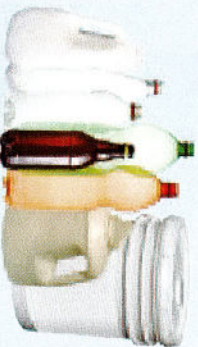
Plastic Containers (#1-#7, 5-gallon pails)