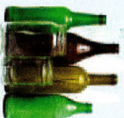
Glass Bottles (Food jars, beverage)