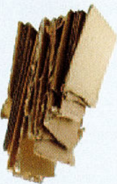
Corrugated Cardboard (Wavy center layer)